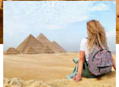
The Great Sphinx of Giza, Giza Plateau, Egypt