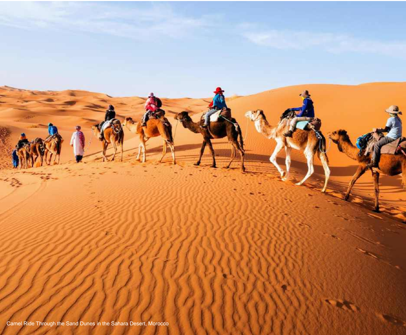
Camel Ride Through the Sand Dunes in the Sahara Desert, Morocco

Day 1: Arrival in Casablanca Day 2: Rabat - Chefchaouen Day 3: Chefchaouen - Fez Day 4: Fez tour Day 5: Fez - Ifrane - Merzouga Day 6: Merzouga - Quarzazate Day 7: Quarzazate - Marrakech Day 8: Marrakech tour Day 9: Marrakech - Casablanca Day 10: Final departure