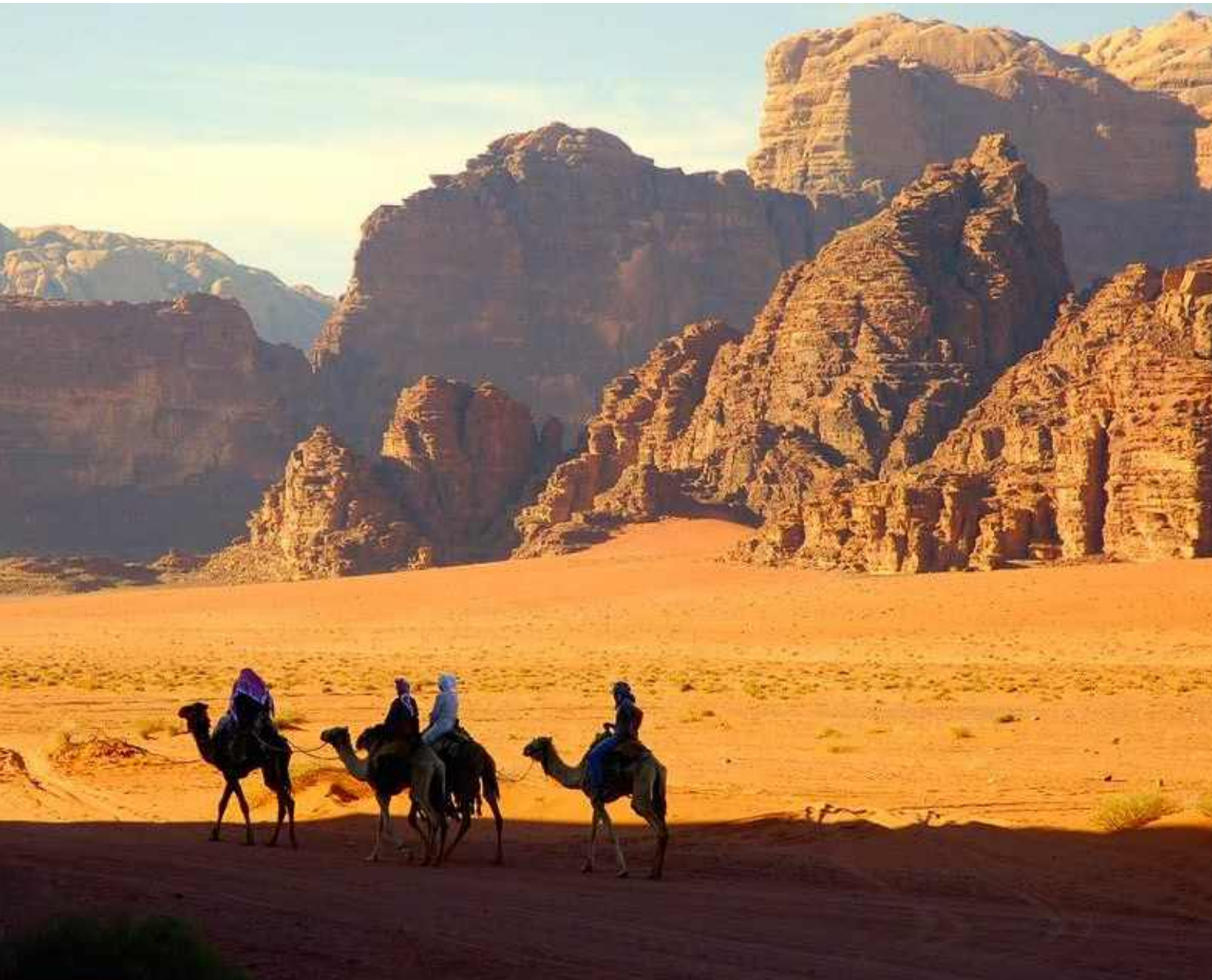
Camel Trip in Wadi Rum Desert, Jordan