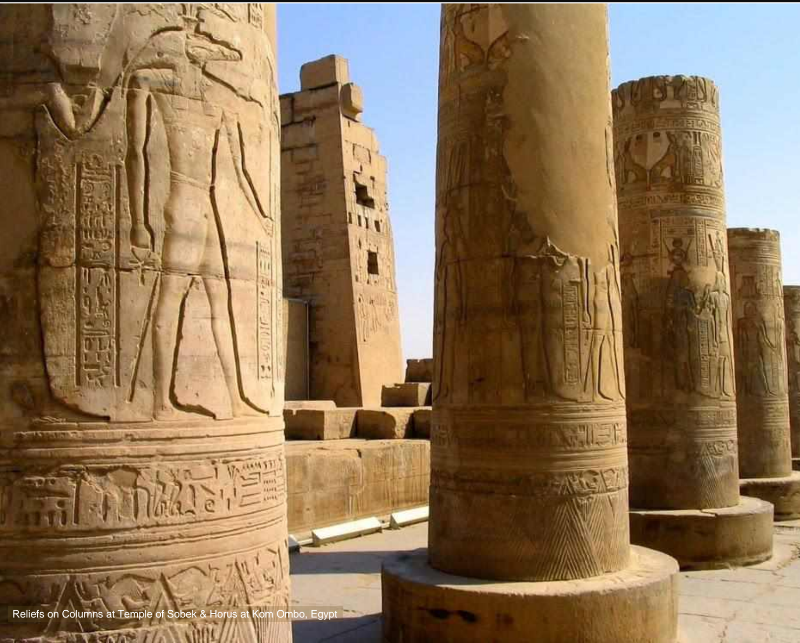
Reliefs on Columns at Temple of Sobek & Horus at Kom Ombo, Egypt

Please note that all tours and accommodations can be fully customized according to your preferences.