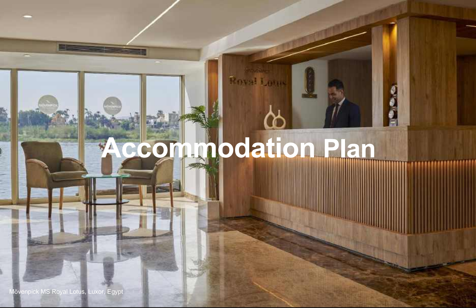
Mövenpick MS Royal Lotus, Luxor, Egypt